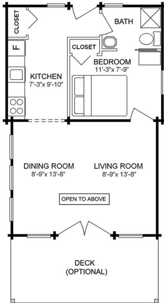
MAIN FLOOR PLAN 531 sq. ft. (49.29 sq. m.)